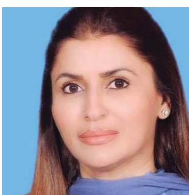
Forum, SDGs Taskforce, and Parliamentary Child Rights Caucus have played

The Federal Women's Parliamentary Caucus, Young Parliamentarians