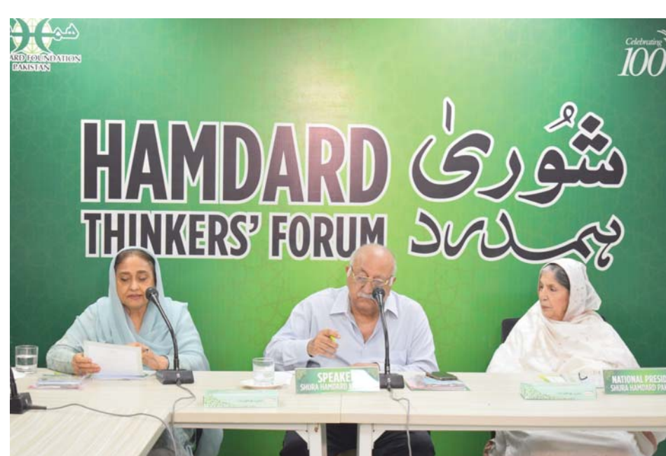
unjustified increase in wealth and possessions are taking place on

Justice (R) Zia Pervez stated that both extravagance and miserliness are highly condemned traits according to Islamic teachings. In our society, the visible consequences of display, unnecessary extravagance, and the relentless pursuit of material progress have become the norm. Illicit and forbidden means are employed to increase income, leading to despair, envy, and animosity among underprivileged segments of society. As a result of this behavior, depression is increasing on the one hand, while corruption and an