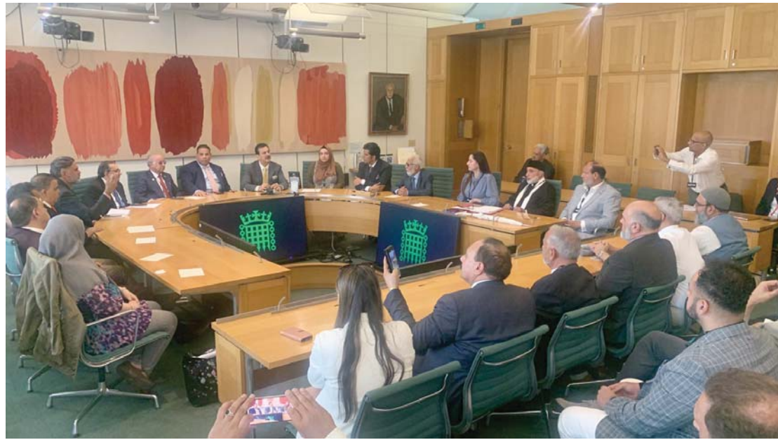
IIOJK, who continue to suffer under the relentless onslaught of Indian

Senator Gillani stressed the urgent need for increased support and solidarity with the beleaguered people of