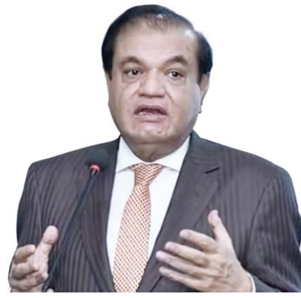
to address in the short term.

The next installment will be possible only after a quarterly review of operational progress on these issues. The IMF's conditions indicate fundamental flaws in the country's economy, but these will be extremely difficult