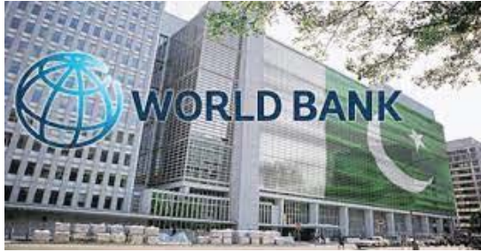
The Punjab Family Planning Program will provide timely access to quality family planning services free of charge. It will also institutionalize quality of care across the family planning services delivery system. It will support public