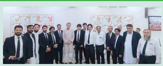
Shah Mehmood Qureshi paid Tribute to officials of Insaaf Lawyers Wing for the release of PTI leaders and workers.