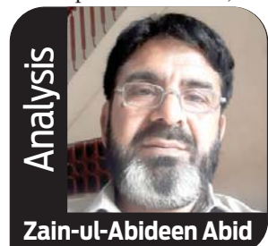
Analysis Zain-ul-Abideen Abid

Stolen goods worth more than 4 crore rupees were recovered during six months, which can be called encouraging performance of Multan police. There is no doubt that the shortage of police personnel is being met with the help of modern technology. This is the need of the hour.