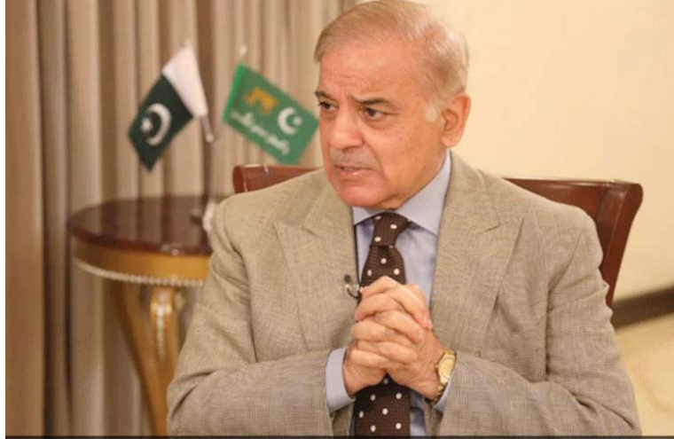
recommendations regarding the participation of the Pakistan team in the ODI World Cup in India to PM Shehbaz, who will then take the final decision.

The development comes days after the PCB wrote a letter to Pakistan prime minister Shehbaz Sharif and the interior and the foreign ministry to seek an official clearance to travel to India for the ODI World Cup in October-November.