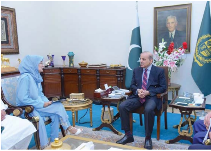
of Dr. Aafia," said Dr. Fowzia.

"By extending support to me in obtaining U. S. visa for my visit, you have laid the foundation of the release