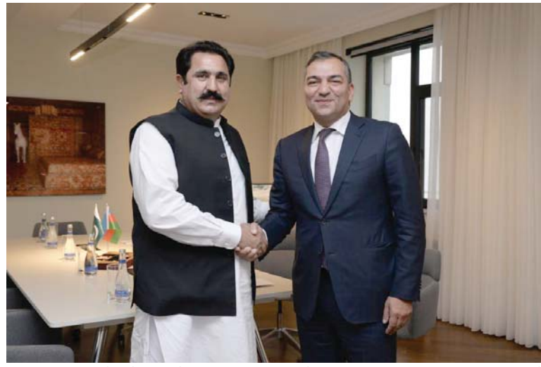
Minister Sajid Turi and Chairman Fuad Naghiyev shaking hands during their meeting in Baku.

This significant gathering follows in the footsteps of the recent visit by Pakistan's Prime Minister Shahbaz Shareef to Azerbaijan, showcasing the growing priority placed on bilateral tourism ties. The exchange of ideas and experiences the two nations to enhance the overall