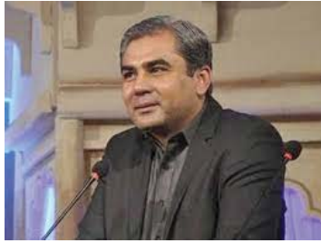
also visited Garden Town, Gulberg and CBD Main Boulevard Underpass.

The citizens complained about sluggish water drainage work in Islampura on which CM Mohsin Naqvi assured early completion of water drainage work and apprised them that he is in the field since morning. "Your difficulty is my difficulty and have issued direction to WASA to expeditiously complete water drainage work by utilising more resources". Mohsin Naqvi