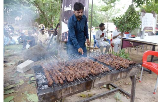
Mosques are centers of spiritual social development. They have the potential to become centers of