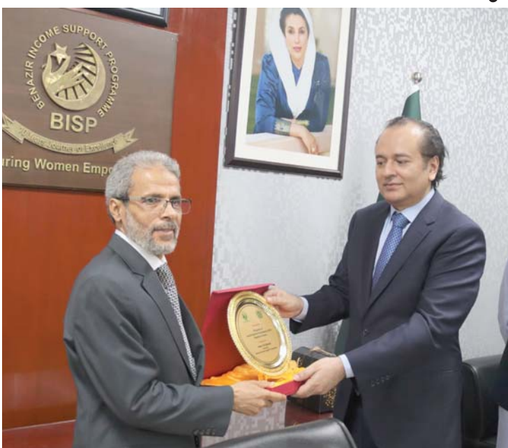
Rs. 81 billion are being disbursed to 9 million deserving families in a quar-

Secretary BISP while addressing the delegation, said that such study visits help both sides to share experiences and ideas and learn from each other. He informed the visiting delegates that the day they arrived in Pakistan, disbursement of Benazir Kafaa-lat tranche was also stated by Benazir Income Support Programme. The Secretary informed the delegation that