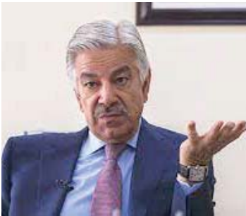
Muslims when he was CM Gujarat". Lambasting the Indian PM, Khawaja

Taking to Twitter, the federal minister pointed out that "the irony of this statement coming during the visit of someone who was banned entry to the US for overseeing a pogrom of