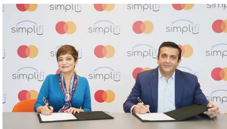
record time. SimpliFi empowers businesses to have financial ownership by enabling them to issue payment cards to stream-

With demand for digital payments rapidly accelerating in the region, along with the shift towards cost-effective payment solutions, this strategic partnership will empower businesses to bring to market Mastercard-enabled payment products and services in