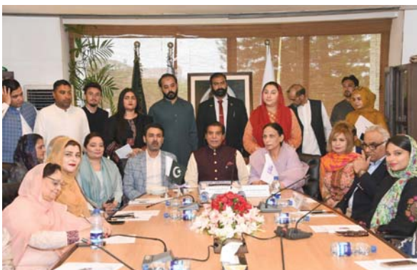
Mohtarma Benazir Bhutto. Pervez Ashraf was invited as the chief guest in the ceremony.