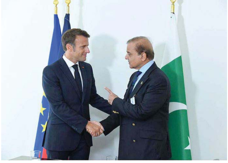
PM Shehbaz will also join reception hosted by the French president for the participating dignitaries. During the visit, the prime minister will also hold bilateral meetings with different heads of state.

During the visit, the prime minister will attend the New Global Financing Pact Summit being hosted by France and participated by heads of state and delegates from over 50 countries.