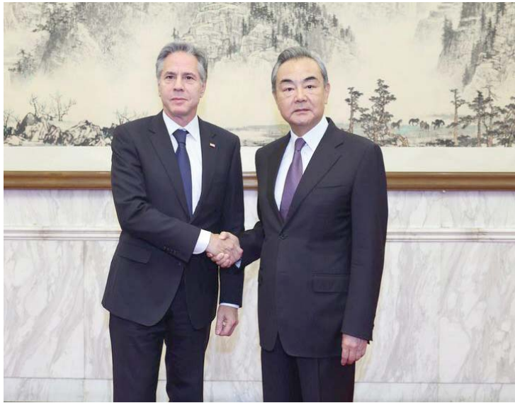
Wang underscored that the root cause is U. S. misperceptions toward China, which have led to misguided China policies.

Noting that relations between China and the United States are at a low point,