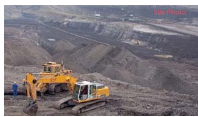
belonging to the Goharullah Off Fath Group, which has been in dispute for a long time. The owners were previously stopped from working on the land, and the case is currently under investigation by the Sindh High Court, NAB, and other government

Initial investigations revealed that the incident occurred on a disputed land