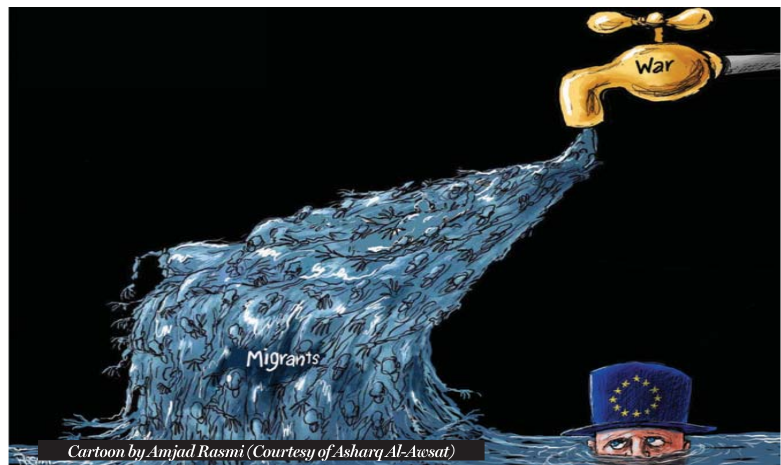
Cartoon by Amjad Rasmi (Courtesy of Asharq Al-Awsat)

"CPEC has now entered its vital phase of facilitating the industrialization process in Pakistan. The Special Economic Zones under CPEC have the potential to be a game-changer not only for Pakistan but for the entire region. With attractive incentives, these SEZs will be the mainstay of FDI in Pakistan. Gwadar Port with its infrastructure upgrade and strategic location augments these SEZs, adding to Pakistan's stature as an attractive investment destination", the ambassador added.