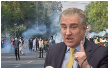
cradle of lies

MULTAN: Vice Chairman of Pakistan Tehreek-e-Insaf Makhdoom Shah Mehmood Qureshi has said that 21 cases have been registered against me. I remained firm despite solitary confinement and did not waver, which has removed all speculations and ambiguities. I was not present in Multan and I am not involved in any incident so I don't know why I have been involved. He expressed these views while talking to the media after his appearance in District Kachhari, Multan. They said 5 cases were registered against me regarding May 9, 13 provisions are the