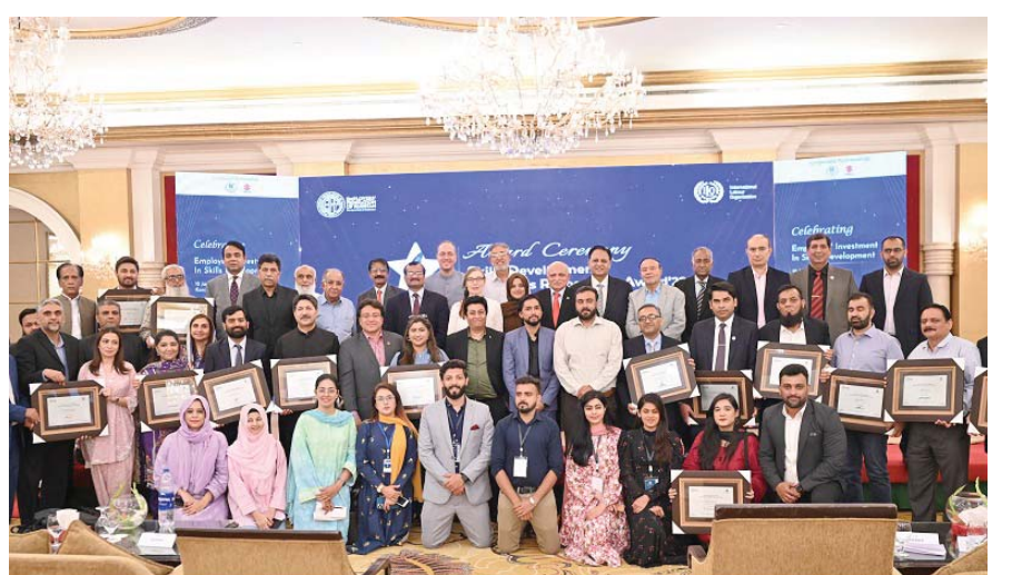
Mills, Nergyico Pk, Procon Engineering, PCI Automotive, Shabbir Tiles & Ceramics, Movenpick Hotel Karachi and Chase Up won the awards.