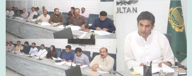
Quratul Ain Asim

MULTAN: Deputy Commissioner Umar Jahangir has issued an ultimatum to the district officers and land record centers for the collection of government revenue dues. Ads should be blocked and published. He expressed these views while presiding over a meeting of revenue officers and ADLRs. On this occasion, Additional Deputy Commissioner Revenue Noman Afzal gave a briefing on the collection of dues. Deputy Commissioner Umar Jahangir said that water taxes including property and death fees should be collected 100 percent in a week while FBR went out in the field to collect taxes. Reforms have been made to provide relief. Strict action will be taken against the officers who do not submit the revenue dues in the current month.