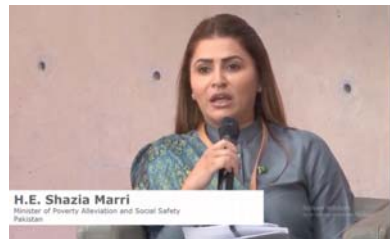
H.E. Shazia Marri Minister of Social Assistance and Social Safety

to the German Government, specifically Minister Schulz, and other partners, including the World Bank and German Development Partner GIZ, for hosting an event on such an important subject. She acknowledged Pakistan's vulnerability to climate hazards, citing the examples of last year's devastating floods and the ongoing threat of a cyclone BIPARJOY targeting Pakistan and neighboring India.