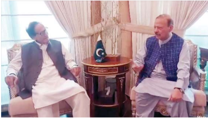
the political situation of Azad Kashmir. President of Pakistan Muslim

ISLAMABAD: President of Azad Jammu and Kashmir Barrister Sultan Mahmood Chaudhry met with President of Pakistan Muslim League Q and former Prime Minister of Pakistan Chaudhry Shujaat Hussain in Islamabad. Federal Minister Chaudhry Salik Hussain was also present in the meeting. In this meeting, Azad Jammu and Kashmir President Barrister Sultan Mahmood Chaudhry and Pakistan Muslim League President and former Prime Minister of Pakistan Chaudhry Shujaat Hussain discussed the latest situation in Occupied Kashmir and ongoing Kashmir Freedom Movement in occupied Kashmir, both discussed