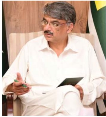
will be provided to increase the interest of tourists". Referring to Azad Kashmir's unique

About the beautification of tourist places, the PM said, "Lights will be installed at various tourism spots of Azad Kashmir and essential facilities