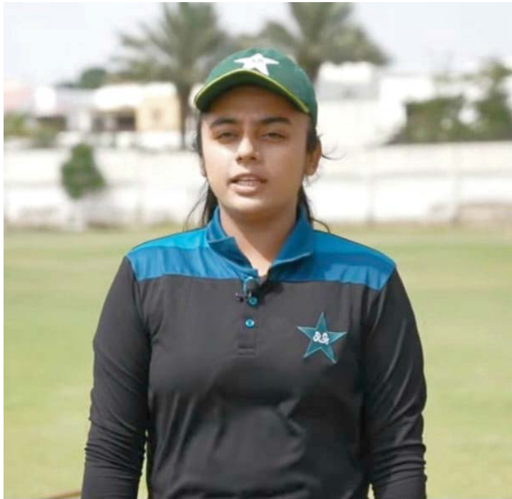
the objective of expanding the selection options for the national squad,

Later, that year, Eyman featured in the phase one of the T20 Women's Cricket Tournament, held from 26 November to 2 December at the LCCA Ground in Lahore. The first phase of the tournament was planned with