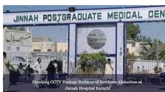
Shocking CCTV Footage Surfaces of Newborn Abduction at Jinnah Hospital Karachi

As per the details, the mother of the newborn took a nap during which an uniden-