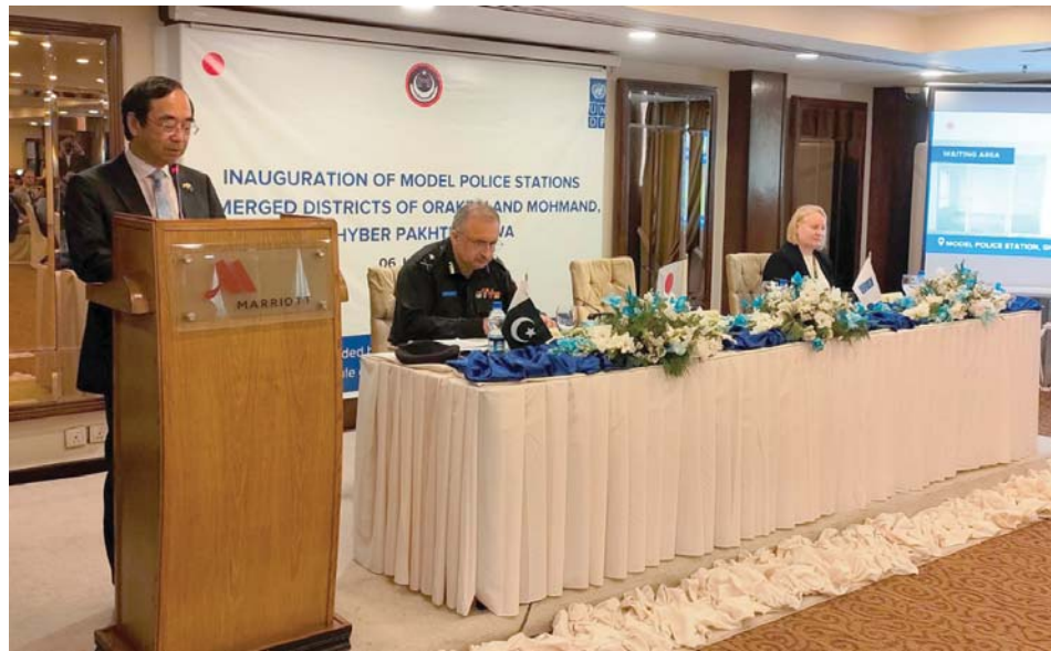
for station house officers, security posts, lodging facilities to accommodate 55 police person-

The Model Police Stations are unique police centres in merged districts, as they provide a range of new facilities to better serve the people of merged districts. Amongst others, these include a gender-responsive desk to address gender-based crimes reported to the police stations, a hall to convene joint community and police meetings, an investigation room, an office