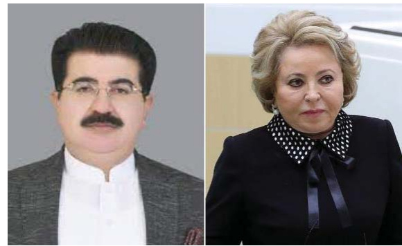
regional and international issues and resolved to work

The two sides agreed to continue cooperation on