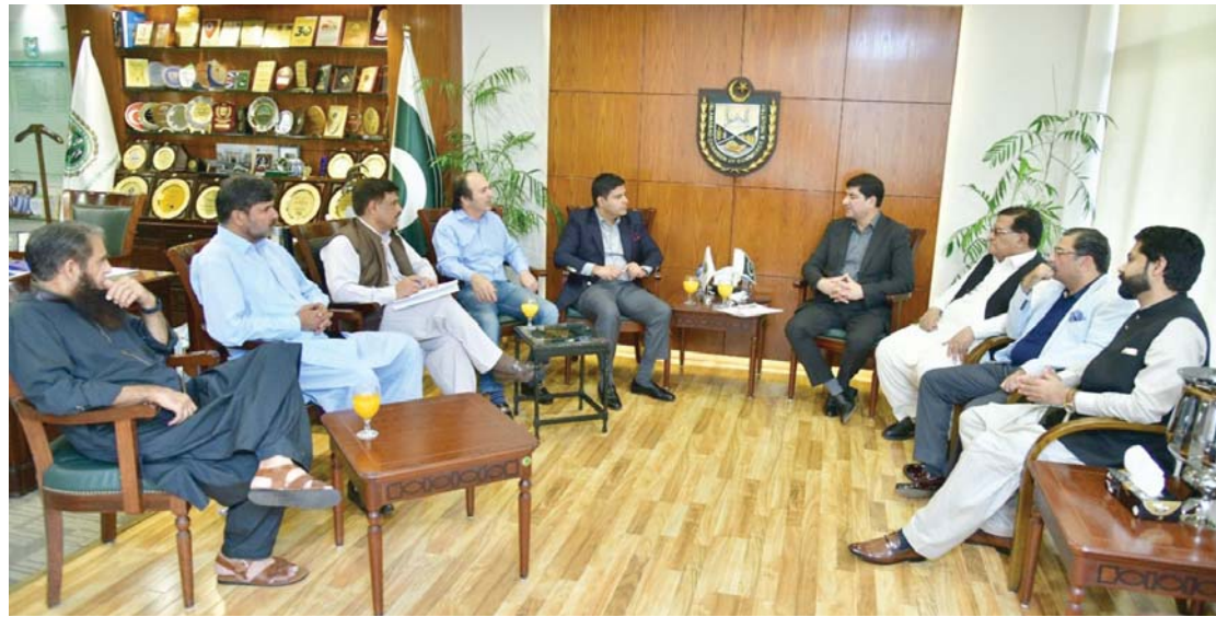
eration of the federal government. He said that there are vast investment opportunities in the hotel industry

in Gilgit. Islamabad Chamber should take advantage of this, there is a need for work in this field from the platform of the Chamber. We wish Islamabad Chamber to work in this regard as well.