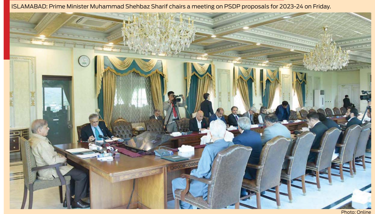
ISLAMABAD: Prime Minister Muhammad Shehbaz Sharif chairs a meeting on PSDP proposals for 2023-24 on Friday.