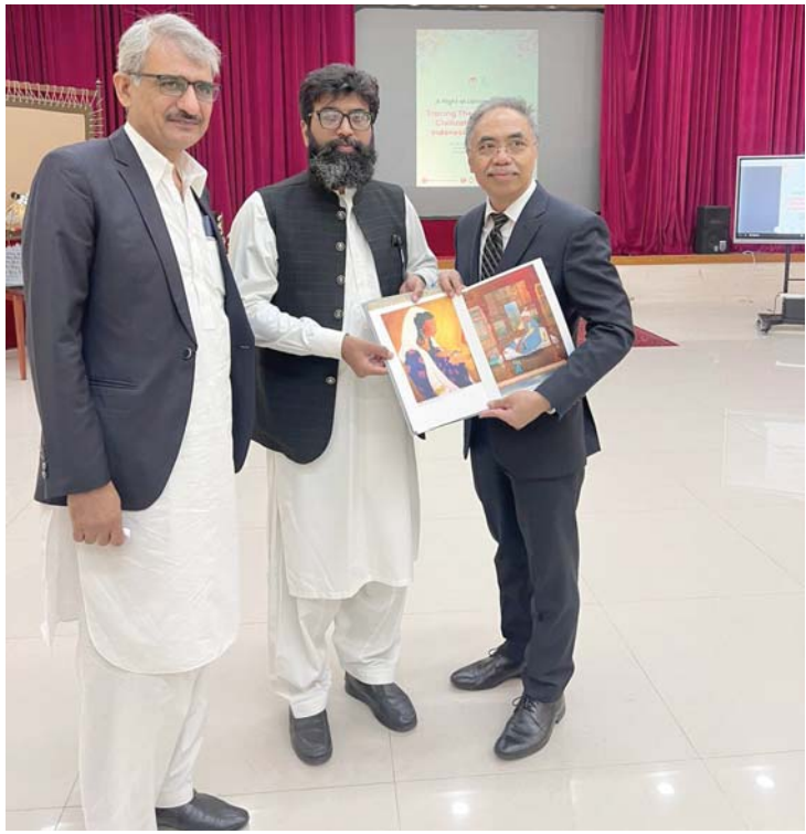
this event successful and attractive for all the visitors.