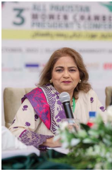
cles in the way of women's development

be removed, and they should be provided with a better environment for business so that they can play their positive role in the development of the country.