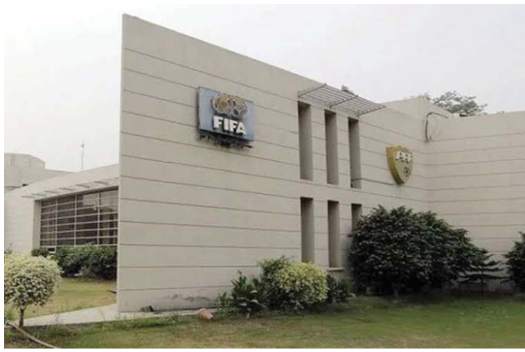
The platform is distraught over the district-level representatives.