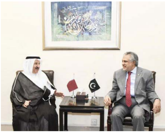
H.E. Sheikh Ebrahim Bin Khalifa Al Khalifa lauded the

The Finance Minister welcomed H.E. Sheikh Ebrahim Bin Khalifa Al Khalifa and congratulated him for the holding of the First International Conference on Islamic Capital Markets in Pakistan in coordination with SECP Pakistan.