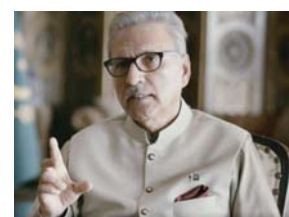
Zarghoun areas of Balochistan.

ISLAMABAD: President Dr Arif Alvi on Friday talked to the family members of the Pakistan Army soldiers who embraced martyrdom in South Waziristan and Balochistan on May 20, paid tribute to the martyrs and expressed sympathies with them.