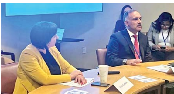
Chairman NDMA highlighted crucial role of Disaster Risks Reduction for develop-