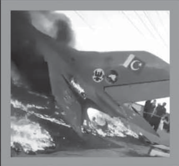
Historic Air Force Jet, Mianwali