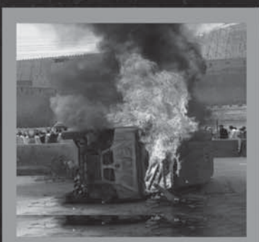
Edhi Ambulance, Peshawar