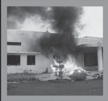
Jinnah House, Lahore

According to the neighbourly approach of the Iranian government, priority is given to the expansion and development of the all-out relations and ties, especially in the economic and trade spheres, with the neighbouring countries including Pakistan. Now this engagement is realised in view of the firm determination of the authorities of the two countries to boost trade and enhance cooperation in all areas.