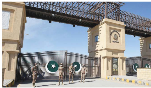
residents of the border regions of the two sides.

Per as the determination of the authorities of the two countries and according to the agreement made previously, the two projects were under the process of construction and presently ready to be inaugurated officially. The historic meeting of the officials of the two countries takes place in a great day for the people of the two countries particularly the