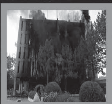
Radio Pakistan, Peshawar