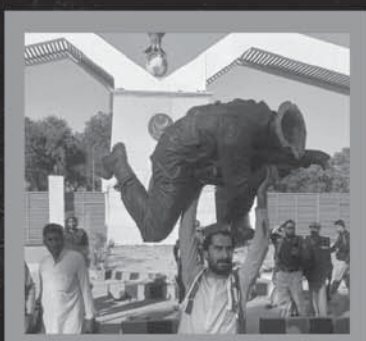
Karnal Sher Khan Shaheed Statue, Mardan