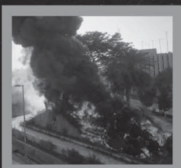
Chaghi Model, Peshawar