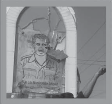
Martyrs Monument, Sargodha