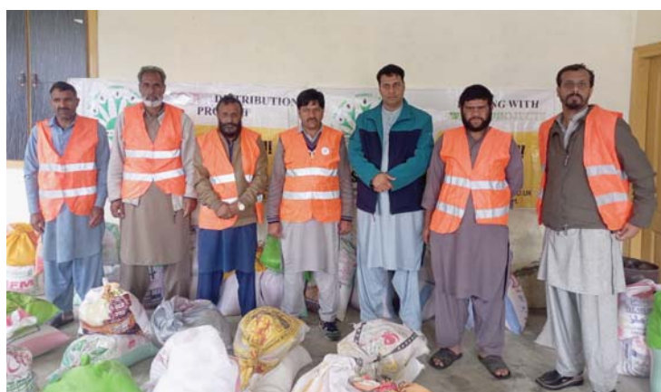
privileged and poverty-stricken families were those that received help during the blessed month of Ramadan.