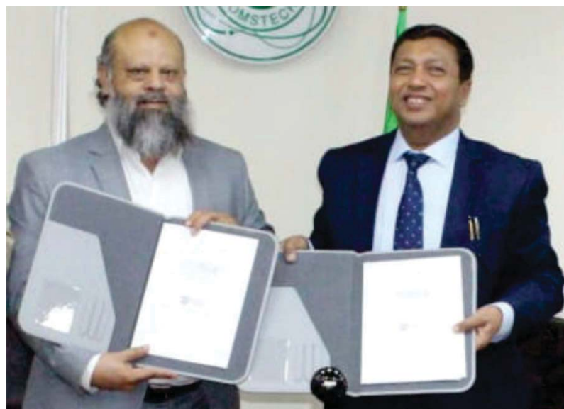
ers/students from OIC Member Countries particularly from Africa will visit Ibadat International University to conduct research for 6-12 months' duration.

COMSTECH will develop a programme in association with Ibadat International University through which young research-