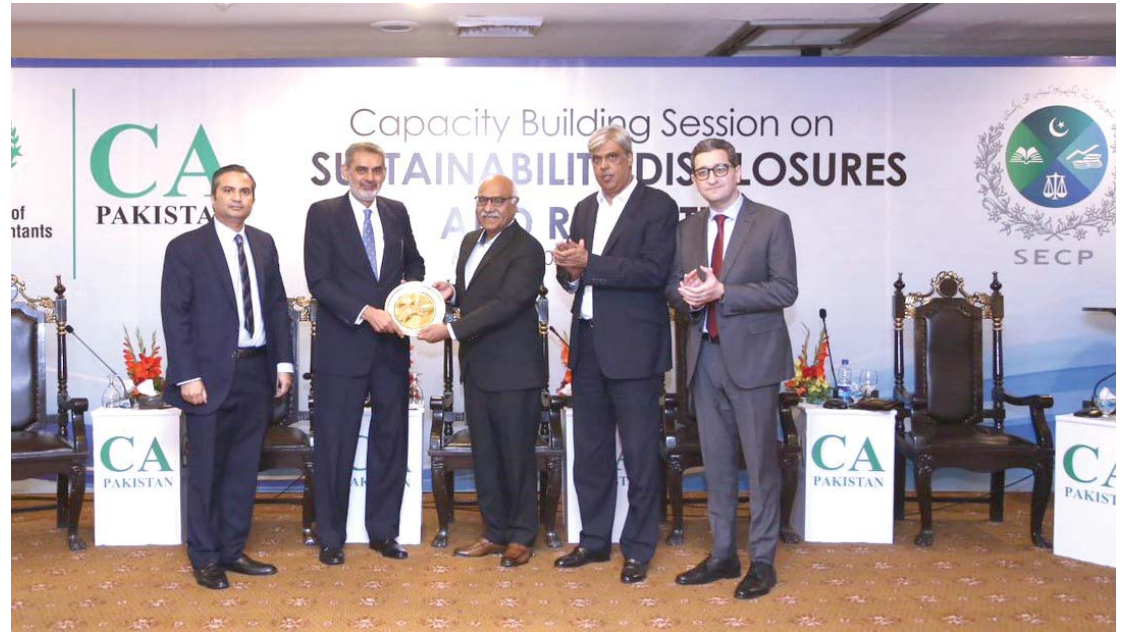
and engaging with all key stakeholders of ESG ecosystem for sustainable economic development.