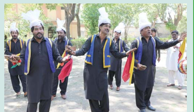
Attock: Folk dances are being performed during a cultural festival organized by the Punjab Arts Council at the Government Post Graduate College.

He said that Sindh education department has followed a system of appointments of teachers in Sindh and it was history mark.