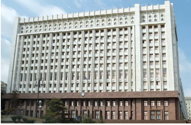
people Heydar Aliyev" on May 8, 2023.

Underlining that the 100th anniversary of founder of the modern Azerbaijani state, genius politician and statesman, National Leader of the Azerbaijani people Heydar Aliyev is the landmark event in the history of our country, revering the dear and eternal memory of the Great Leader, remaining committed to his rich spiritual legacy based on universal values, rule of law and justice ideals, reminding about Heydar Aliyev's exceptional services in implementation of fundamental reforms to build democratic legal state, the importance he attached to safeguarding human rights and freedoms, continuing humanity, compassion and humanitarian traditions, believing that persons to be released from punishment will make their contribution to development of prosperity of our independent state and society, considering the appeals on pardoning to the President of the Republic of Azerbaijan from a group of convicted persons, their family members, Commissioner for Human Rights of the Republic of Azerbaijan, human rights organizations, President of the Republic of Azerbaijan Mr. Ilham Aliyev signed an order "On pardoning of a group of convicted persons on the occasion of the 100th anniversary of National Leader of the Azerbaijani