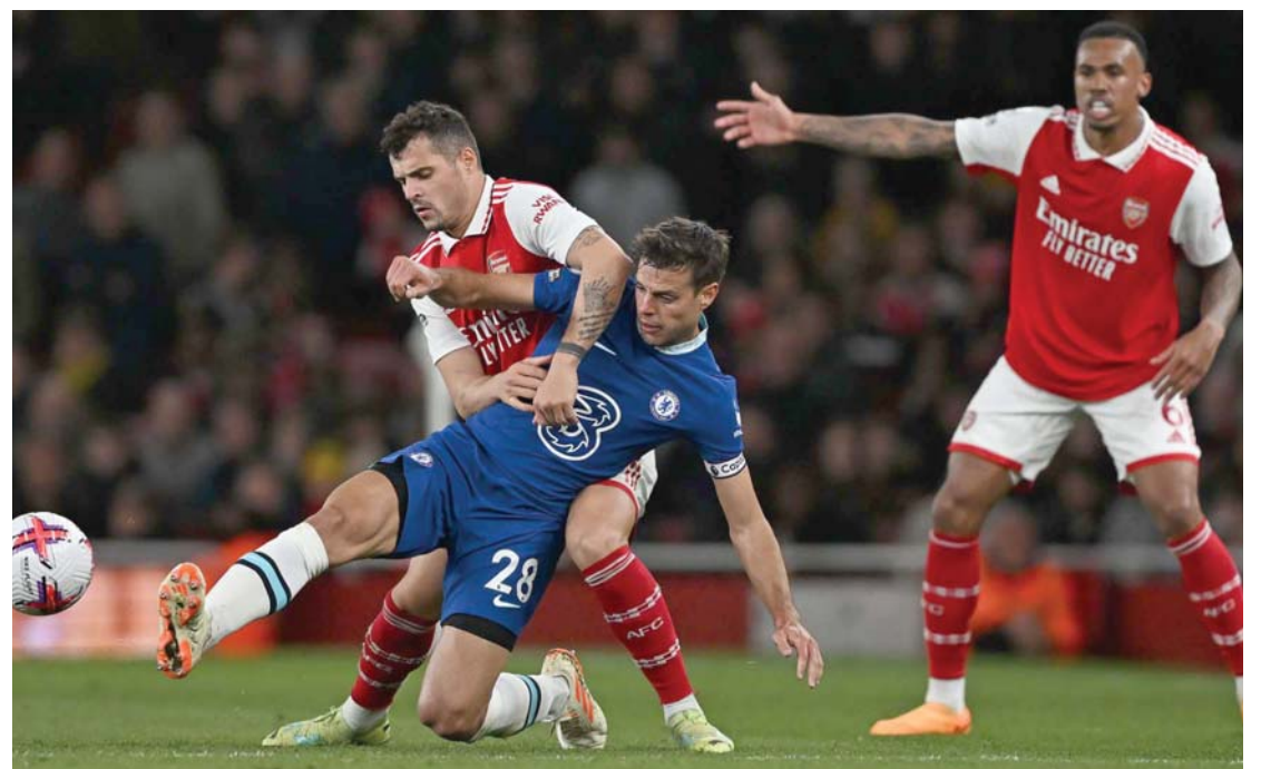
table for the first time since 1996.

Languishng in 12th place, Chelsea are on an nine-game winless run in all competitions and face the prospect of failing to finish in the top half of the