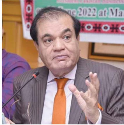
them unable to consider long-term business planning.

The local business community is suffering from extremely high costs of electricity and gas, governance issues and other factors, leaving