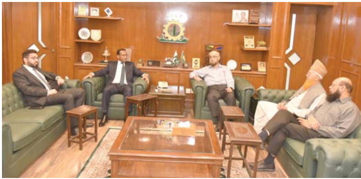
Business Forum", scheduled in Karachi during second week of May.

The ambassador proposed signing of trade agreements between the FPCCI and Ethiopian Chamber of Commerce and Sectoral Associations (ECCSA) during upcoming "Ethiopia-Pakistan