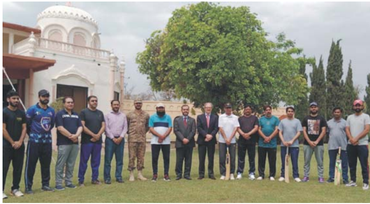
are happy to be here today.