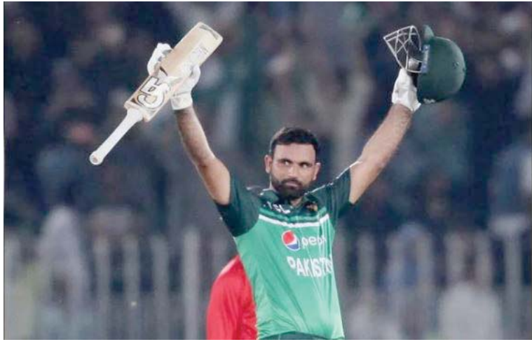
Zaman as "outstanding".

"We were very happy at the halfway mark," said Latham. "Fakhar played an outstanding knock. They were able to build partnerships and that was a big tick in the batting department."