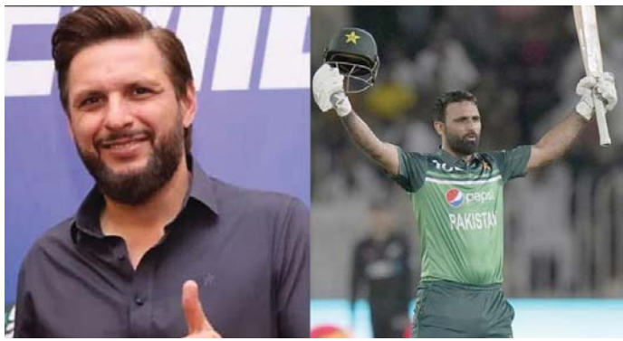
"When I became the chief selector, I talked about Fakhar. Fakhar's name was missing from the list which I got from management. Everyone was involved in that decision," Afridi revealed.

Fakhar was later added to the probables, and made the final squad announced for the series.