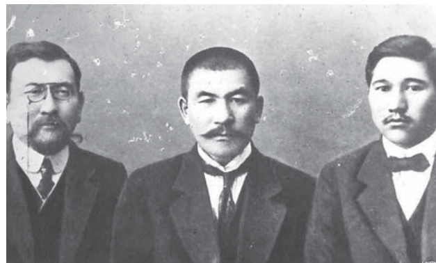
The founders of the "Alash" movement: A. Baitursynov, A. Bokeikhanov, M. Dulatov

As it is known, the leaders of the Alash-Orda were educated in Tsarist Russia, some at that time even had the opportunity to receive a European education. In addition to Kazakh and Russian, representatives of the intelligentsia of Alash-Orda spoke Arabic, French, German, and other foreign languages. Education was the goal of such Alash-Orda figures as Baitursynov, Zhumababev or Dulatov as a key to improve the quality of life in society.