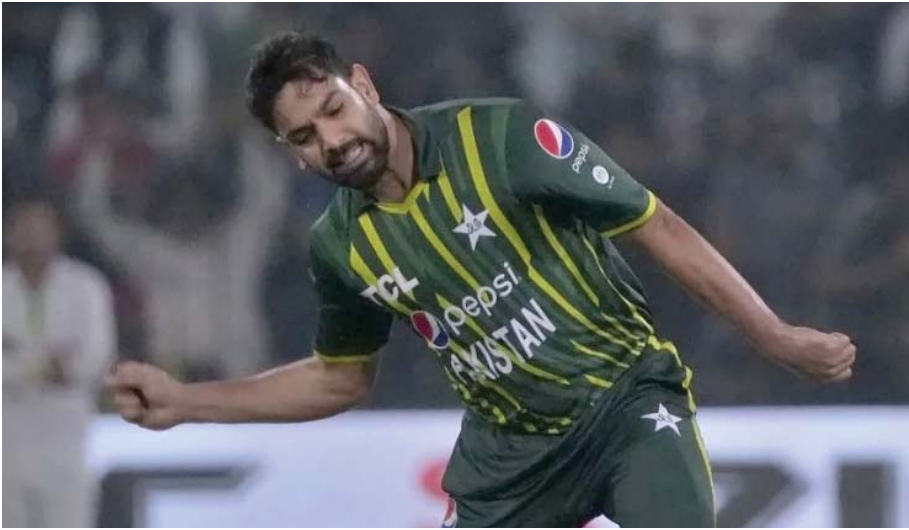
all-format captain Babar Azam also has an opportunity to set a major T20I captaincy record in

the fourth PAK vs NZ T20I as a victory would make him the skipper with the most number