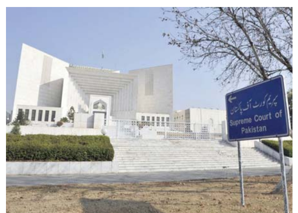
A three-judge bench – led by

Sources further revealed that the meeting between the judges and the security officials continued for over two hours in the CJP's chamber.