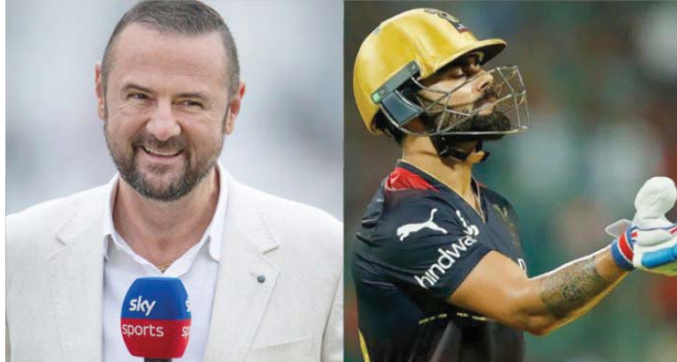
shots," stated Doull during commentary. Concerned about a milestone. I don't think there's room for that in this game

"Kohli started off like a train, he was going hammer and tongs, playing a lot of