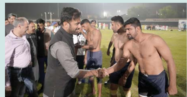
LAHORE: Adviser to Chief Minister Punjab on Sports Wahab Riaz is introducing the players on the occasion of the Kabaddi Championship to be held at the Punjab Stadium regarding the "First Ramadan Sports Series 2023".

30 Apr - Only Four-Day, Chattogram 6 May - 1st One-Day, Chattogram 8 May - 2nd One-Day, Chattogram 11 May - 3rd One-Day, Rajshahi 15 May - 4th One-Day, Rajshahi 17 May - Only T20, Rajshahi