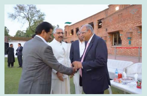
PCB hosts Iftar dinner for staff at National Cricket Academy.

He called upon the sponsors to come forward and lend financial support to LRCA for a collective cause of revival of club Cricket.