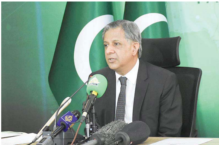
The lawyers' leadership had congratulated Prime Minister Shehbaz Sharif on taking over the charge of the office in April 2022 and the prime minister had thanked them for supporting the democratic forces, he added.

Azam Tarar said today he was happy to see the gathering of the members of Islamabad Bar Association, Islamabad Bar Council and Islamabad High Court Bar Association.