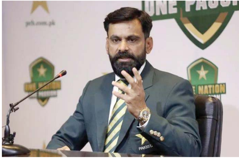
skipper MS Dhoni were also acknowledged by the MCC.

Besides Hafeez, England's World Cup-winning captain Eoin Morgan and five Indian players including legendary