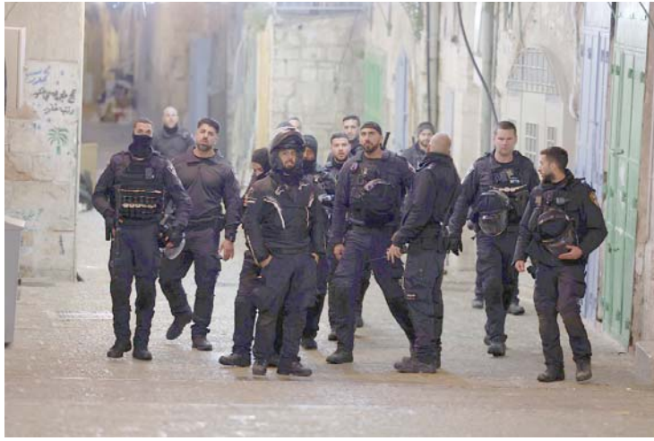
the way for Jewish fanatics to storm the holy compound in the morning.

The Israeli police removed the Muslim worshippers in order to prepare