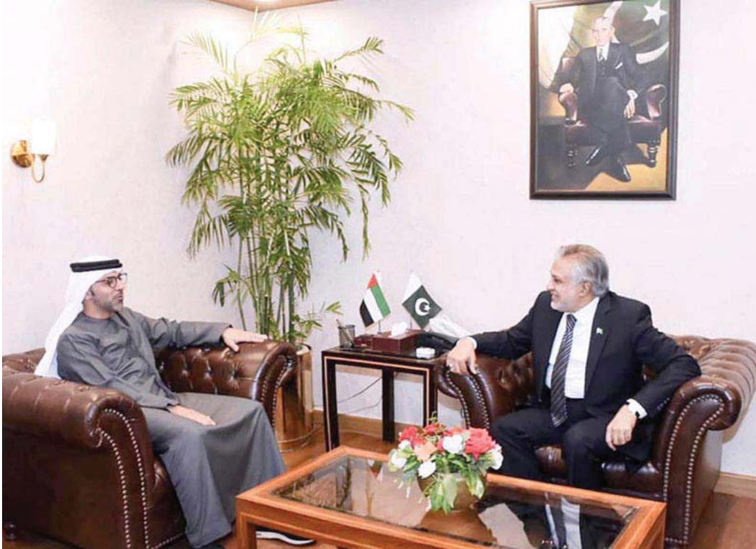
In conclusion, the Finance Minister shared sentiments of gratitude for good will and cooperation of his Excellency and hoped to enhance the bilateral relations further in the future.

Finance Minister Senator Ishaq Dar welcomed the investment proposals of the UAE in Pakistan and extended full support and cooperation by the