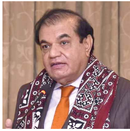
an alternative plan otherwise economic reforms would not become a reality.