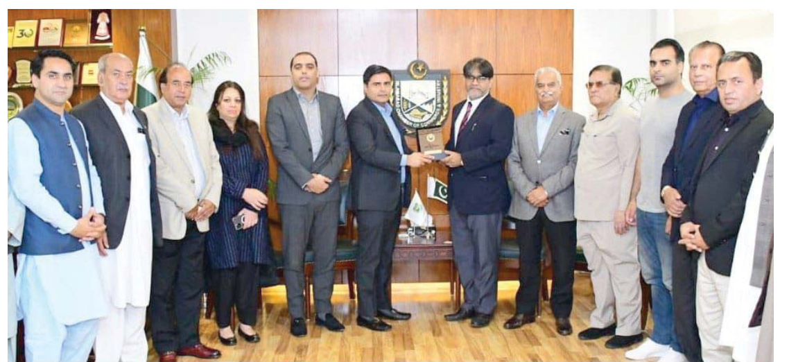
and shared useful ideas to improve trade and economic relations between Pakistan and Tajikistan.