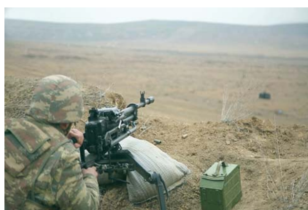
al of international efforts for a peace agreement.

These steps of Armenia have shown its intention to purposefully disrupt the peace process, as well as its lack of interest in ensuring peace and stability in the region, amid the recent reviv-