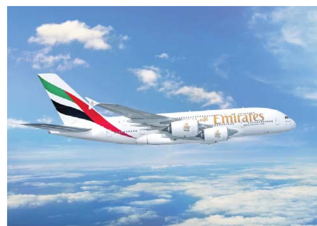
ates A380 service, which will operate in early June, and are