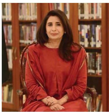
Consultations will be held next week in Kuala Lumpur.

Talking about the upcoming diplomatic engagements, the spokesperson said Pakistan-Malaysia Bilateral Political