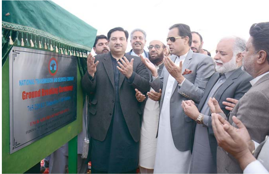
Khurram Dastgir said that 2000 megawatts of electricity will be added to the national grid from Thar coal project this year. Prime Minister will inaugurate the power project

While addressing the ceremony, Federal Minister said that the present government is exerting full efforts to utilize local resources for generation of electricity to reduce the reliance on expensive imported fuel. He said that 765 kV Mansehra Grid Station project is funded by World Bank with an estimated cost of PKR 24 billion and will be completed within 30 months. The grid station will be connected to a 765 kV double-circuit transmission line for evacuation of 2160 MW cheap and environment friendly electricity from the first stage of the Dasu Hydropower project. This project of transmission lines and grid stations will cost a total of PKR 132 billion.