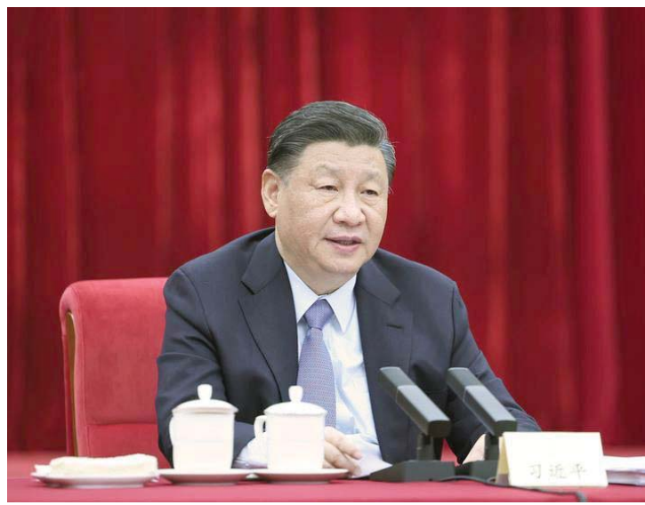
the visit and discussion.

Wang Huning, Cai Qi and Ding Xuexiang, members of the Standing Committee of the Political Bureau of the CPC Central Committee, joined