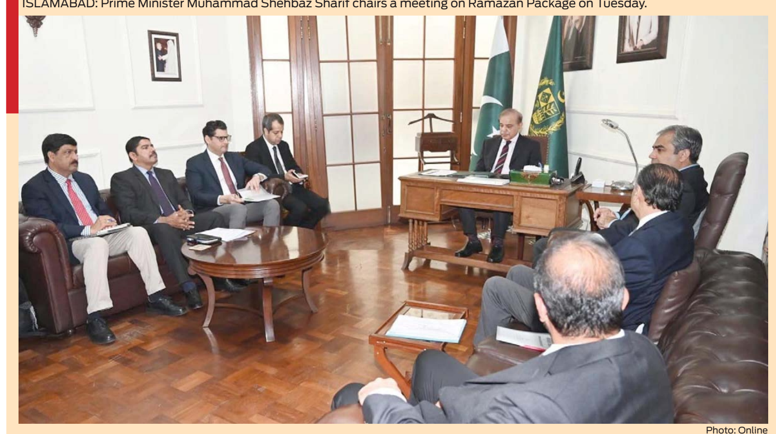
ISLAMABAD: Prime Minister Muhammad Shehbaz Sharif chairs a meeting on Ramazan Package on Tuesday.

PM announces free wheat flour for poor under Ramazan package ISLAMABAD: In a big relief for poor, Prime Minister Shehbaz Sharif on Tuesday announced a Ramazan package providing free wheat flour to the inflation-hit people. The package is first of its kind aimed at facilitating the poor population. Chairing a review meeting, the prime minister said after its launch in Punjab, the federal government would extend cooperation to provinces to replicate the programme. The prime minister directed the authorities concerned to complete the comprehensive strategy for the supply of flour to the poor families as soon as possible. Chief Secretary Punjab Zahid Akhtar Zaman and Finance Secretary Mujahid Sherdil briefed the prime minister about the Ramazan package. Caretaker Chief Minister Punjab Mohsin Raza Naqvi, the Secretary Food and other senior officials attended the meeting. Meanwhile, on his Twitter handle, the prime minister said that he realized the severe difficulties faced by millions of people living below the poverty line due to price hike. On the advent of Ramazan ul Mubarak, the people should come forward and become a source of relief and comfort to the poor segment of society, the prime minister stressed. So, a decision over provision of free flour had been taken, he said and expressed the hope that other provinces would also share their part in this kind gesture.