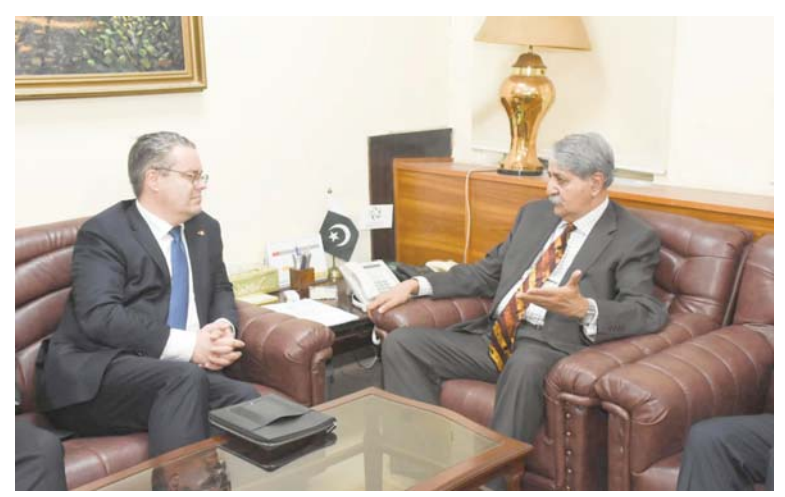
as Pakistan's exports to Germany had of the status.

The minister said that government of Pakistan acknowledges trade benefits being accrued as a result of GSP+ been increased by 34% since awarding