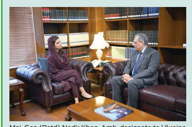
Maj. Gen. (Retd) Nadir Khan, Amb-designate to Ukraine called on Minister of State Hina Rabbani Khar today.

He noted that China's education ought to draw fine contents from the 5,000-year Chinese culture and be inclusive to the achievements of Western civilizations.