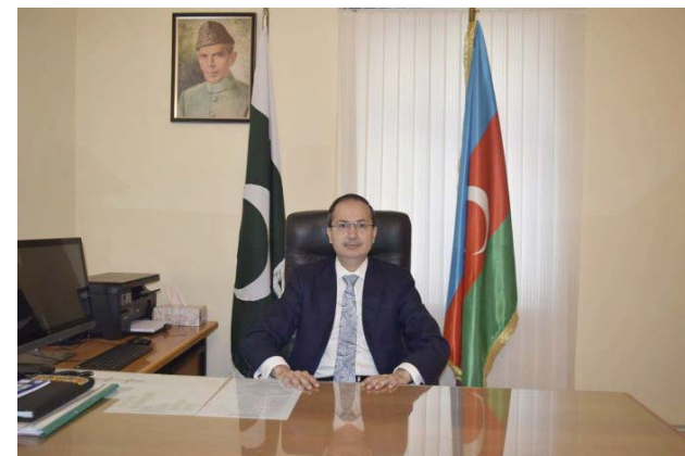
He said the development was always linked to the peace and in

He said at NAM, Pakistan always sought a peaceful resolution of the issues particularly those involved foreign occupation, like Jammu and Kashmir impacting a huge chunk of NAM population.