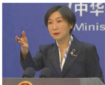
regular briefing on Wednesday.

"The United States once again stirs up the laboratory leak theory, which will not discredit China, which will further lower its own credibility," foreign ministry spokesperson Mao Ning told a