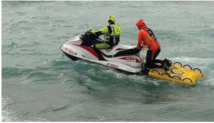
CROTONE: Rescue workers patrol the sea after what local media report to have been a deadly migrant shipwreck, off the eastern coast of Crotona, Italy on Sunday.

Curra said the vessel left Izmir in eastern Turkey three or four days ago, adding that survivors had said some 140