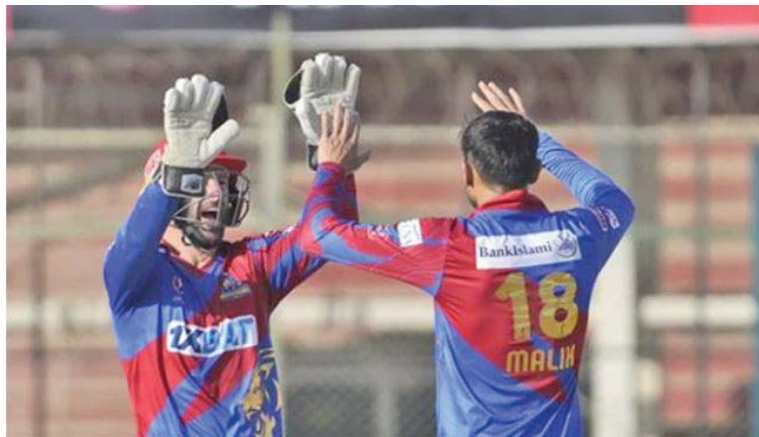
KARACHI: Karachi Kings players celebrate during the 14th match of the eighth edition of the Pakistan Super League played in the National Bank Cricket Arena in Karachi on Sunday.

Veteran all-rounder Malik struck again in his third over as he sent Sultans' skipper Mohammad Rizwan (29) back to the